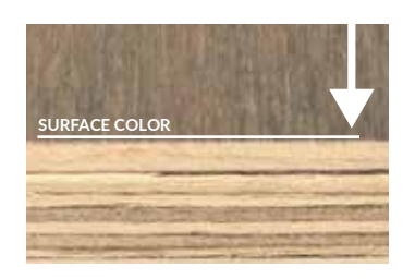
TRADITIONAL COLOR IS APPLIED ONLY TO THE SURFACE