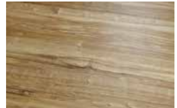
■ Springfield Birch