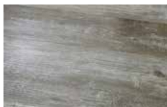
■ Arcadian Oak