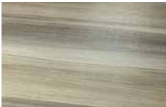
■ Charleston Oak