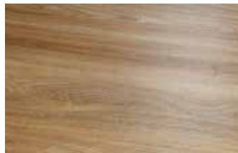
■ Cumberland Cedar