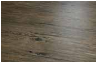
■ Smoky Mountain Pine