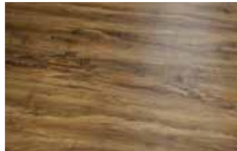
■ Appalachian Birch