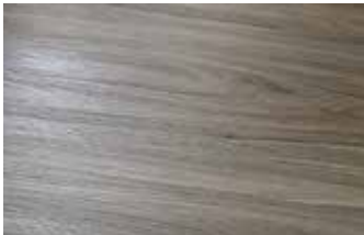
■ Pumilla Elm