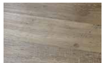
■ Chaminade Oak