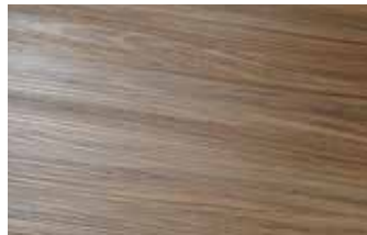
■ Rubra Elm