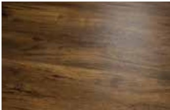
■ Lexington Pecan