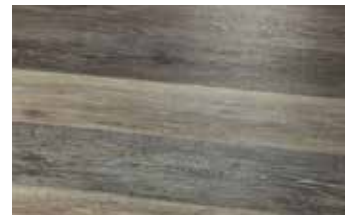
■ Concord Oak