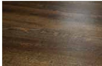
■ Shenandoah Oak