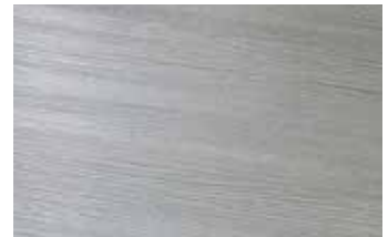
■ Chatham Walnut